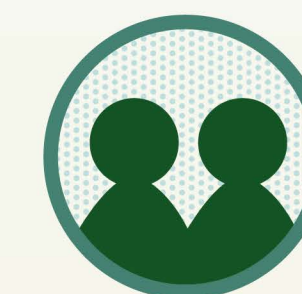
Older Brothers or Sisters