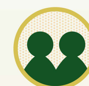
Aunts or Uncles

If you're not sure whom to report as a parent, you can visit StudentAid.ed.gov/fafsa/filling-out/parent-info or call 800-4-FED-AID (800-433-3243).